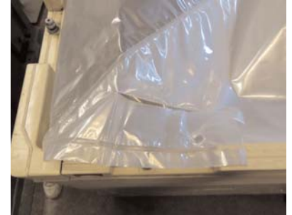
Close up of the torn perforated flap.