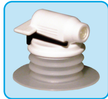
IC-7026 MK5 Push-In Tap