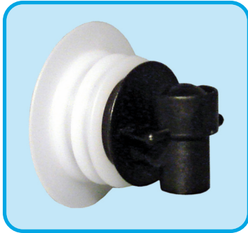
IC-7011 Press Tap