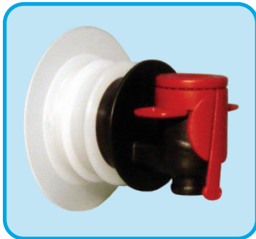
IC-7015 Tamper Evident Vitop® Press Tap