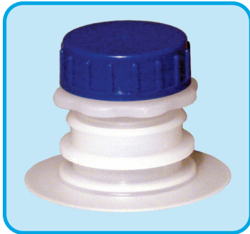
IC-7002 Tamper Evident Adapter