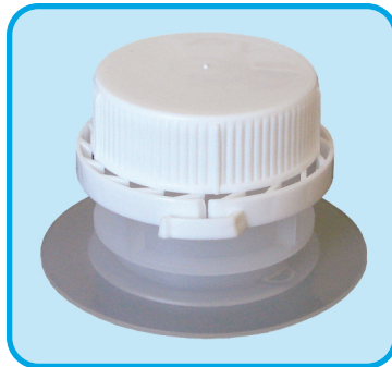
IC-7016 Tamper Evident Threaded Cap Manual fill only