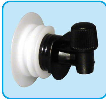
IC-7004 Vertical Twist Tap