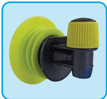
IC-7094 Vertical Twist Tap – Hot Fill

CDF warrants that its products will be free from defects in material and workmanship for one-hundred eighty (180) days after the date of delivery. Warranty claims must be made in writing no later than five (5) business days after the expiration of the warranty period. CDF's obligations under this warranty are limited solely to replacement of such products as are proven to be defective after CDF's inspection. Prior to use, the user shall independently determine the suitability of the products for the user's intended use and user assumes all risk and liability whatsoever in connection therewith. CDF products are intended for single use application. Any reuse of the liner and/or fitment voids this warranty.