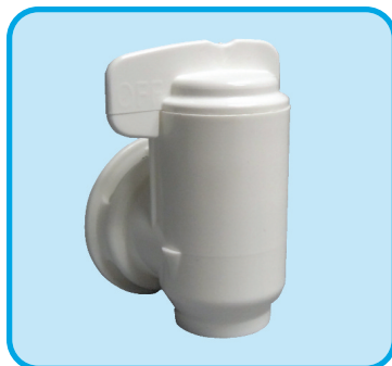
IC-7037 Maxiflow Tap