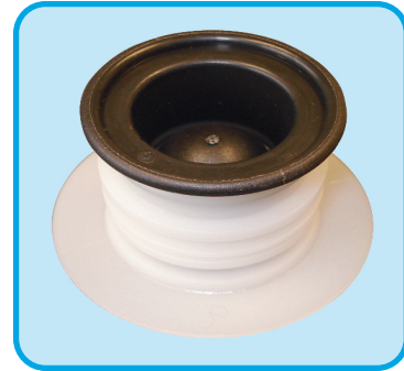
IC-7014 1" Aseptic, Elpo