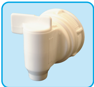
IC-7030 MK5 Screw-On Tap