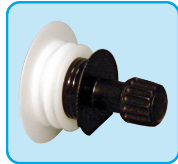
IC-7005 Horizontal Twist Tap