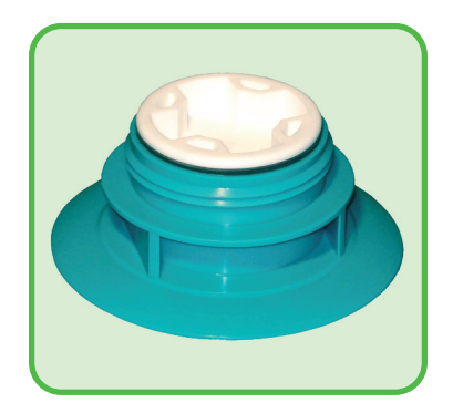
IC-2018 / IC-2009 2" BSP with Non Shouldered Plug