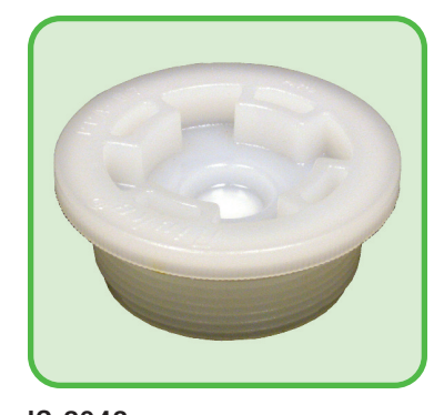
IC-2043 2" BSP Plug, Shouldered