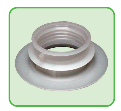
IC-2042 2" Short Buttress