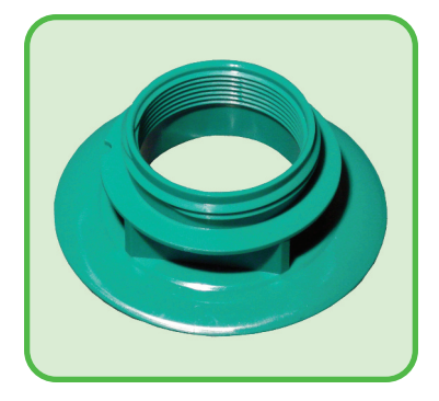
IC-2018 2" BSP Gland