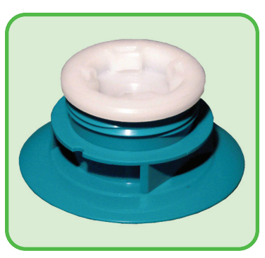
IC-2018 / IC-2043 2" BSP with Shouldered Plug