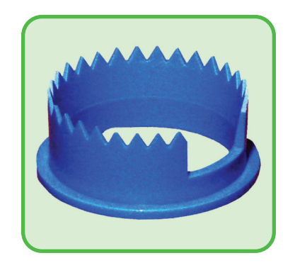
IC-2055 2" Cutter