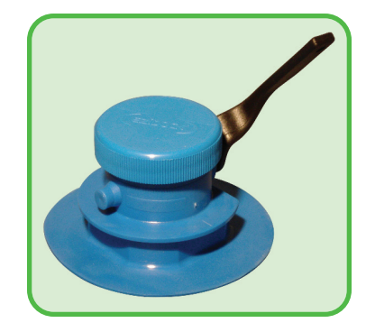
IC-2008 2" Butterfly Valve