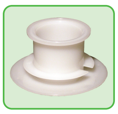
IC-2060 2" Tri-Clover

CDF warrants that its products will be free from defects in material and workmanship for one-hundred eighty (180) days after the date of delivery. Warranty claims must be made in writing no later than five (5) business days after the expiration of the warranty period. CDF's obligations under this warranty are limited solely to replacement of such products as are proven to be defective after CDF's inspection. Prior to use, the user shall independently determine the suitability of the products for the user's intended use and user assumes all risk and liability whatsoever in connection therewith. CDF products are intended for single use application. Any reuse of the liner and/or fitment voids this warranty.