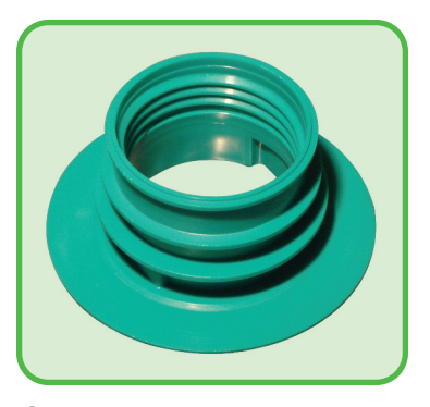
IC-2005 2" Buttress Gland