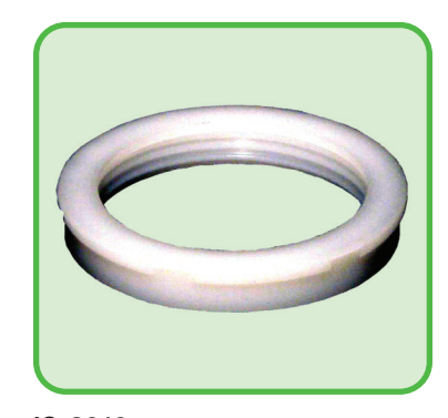
IC-2010 2" Locking Collar