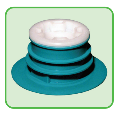
IC-2005 / IC-2044 2" Buttress with Plug