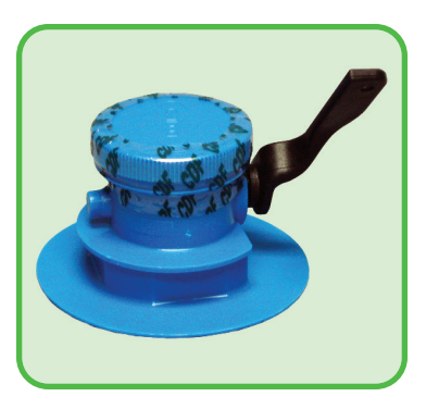
IC-2075 2" Extended Butterfly Valve