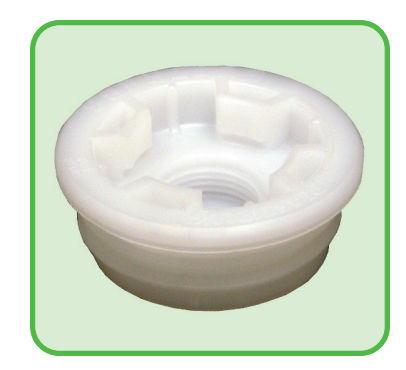
IC-2044 2" Buttress Plug