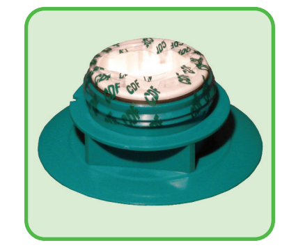
IC-2018 / IC-2009 / IC-9006 2" BSP with Non Shouldered Plug & Tamper Sleeve