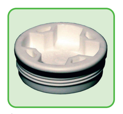
IC-2009 2" BSP Plug, Non Shouldered